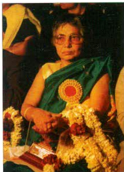
at the Sahitya Akademi Award function