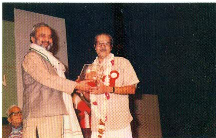
Receiving Sahitya Akademi Award from the President, Prof. U.R. Anantha Murthy