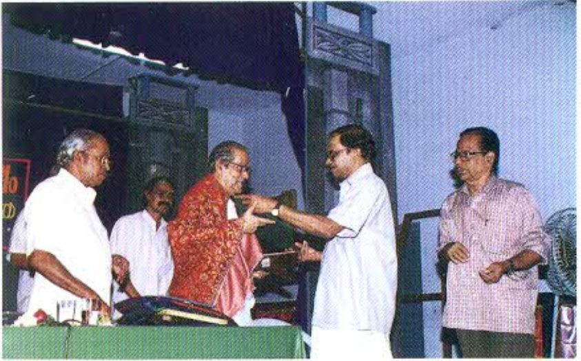
Receiving Kerala Sahitya Akademi Award for total contribution from the President, Shri M.T. Vasudevan Nair. Prof. O.N.V. looks on