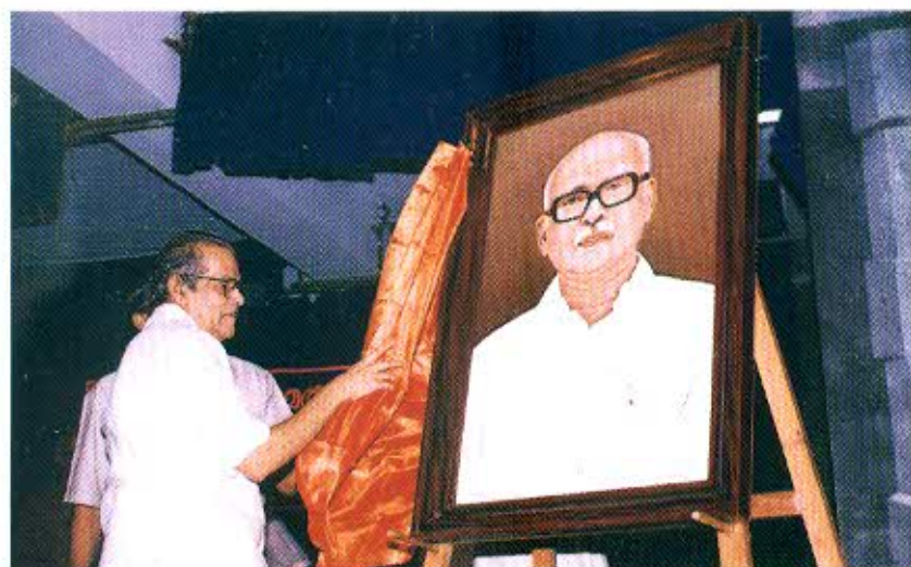
Unveiling the portrait of eminent Novelist Shri K. Surendran