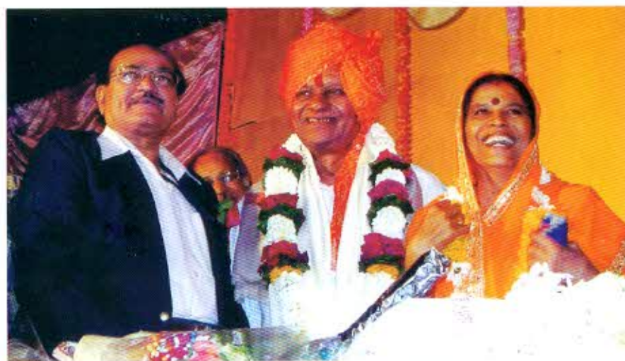
With his wife at a felicitation ceremony