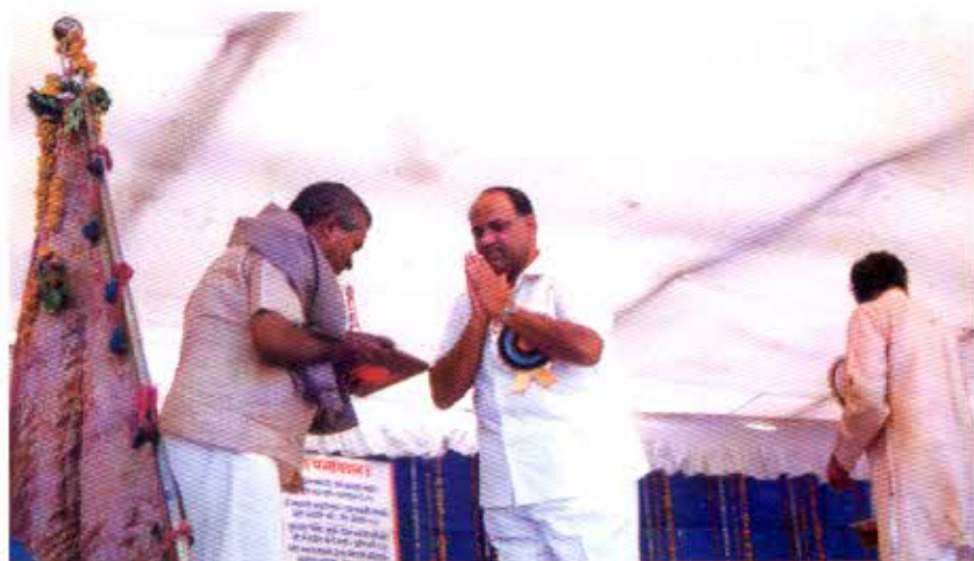
Felicitation by Hon'ble Shri Sharad Pawar, in Dyaneshwari Century Mahostav