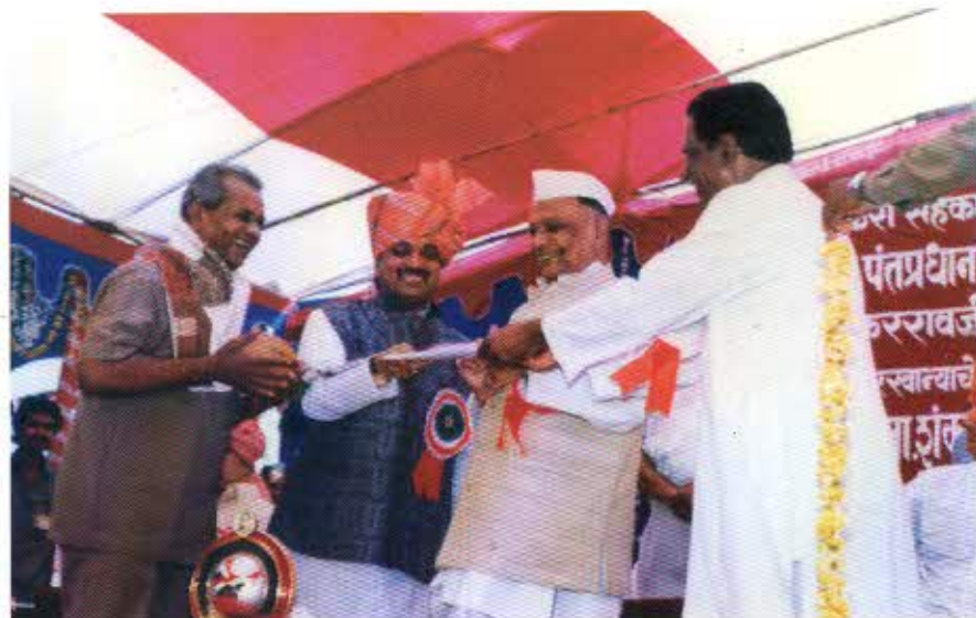
Felicitation by Hon'ble Shri Shankarrao Chavan for the contribution to educational field

creative insights and the writer in him began to think over the social aspects behind the oppressed living conditions of the rural region. It is in this phase that his quest and yearning for unique rural identity commenced.