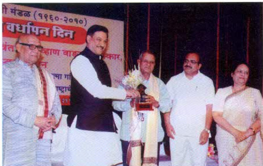
Receiving Sahitya Sanskruti Sanman by Hon'ble Shri Prithviraj Chauhan