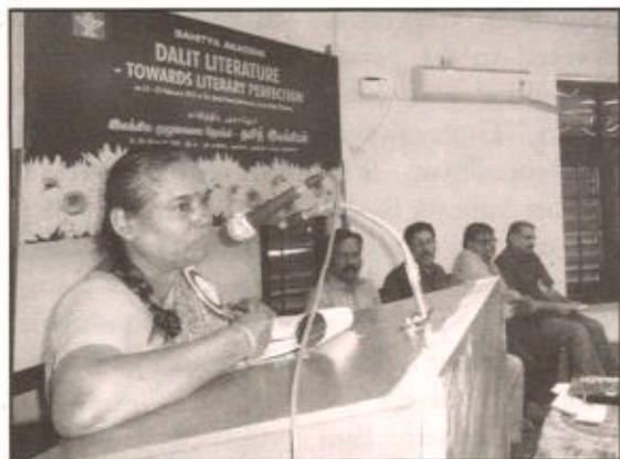
S. Bama speaking in the inaugural session