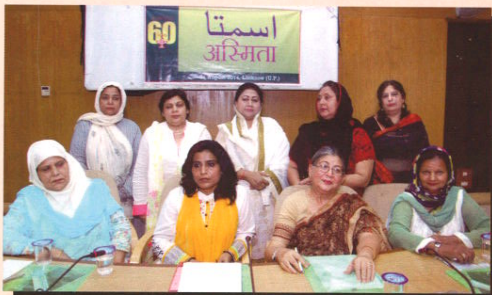
Participants of Asmita programme 31 August 2014, Lucknow