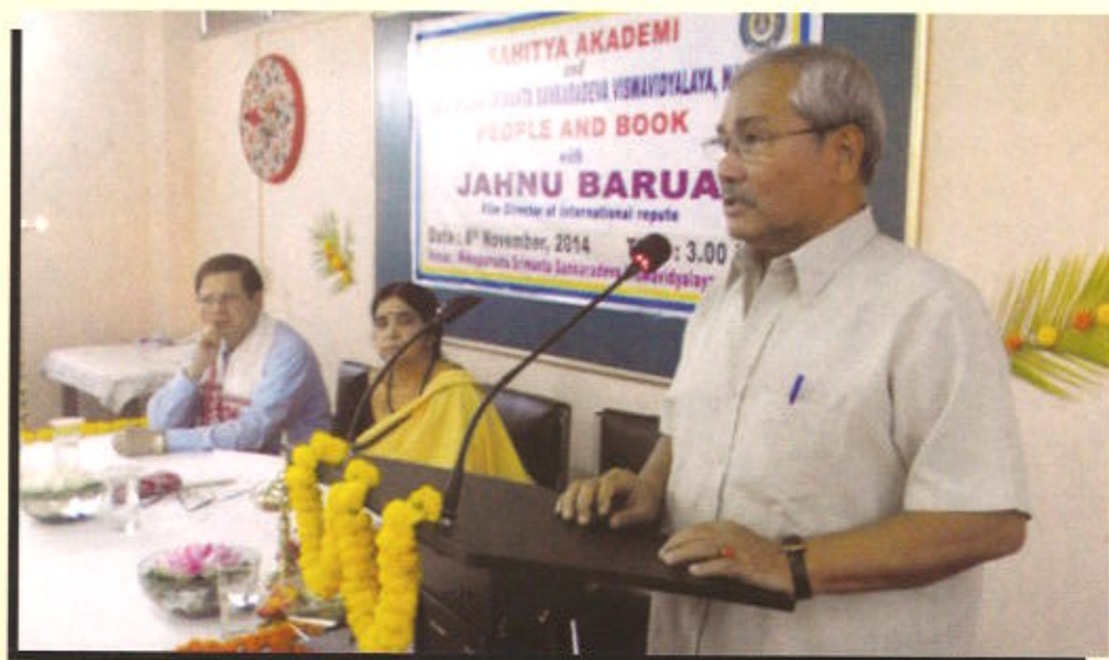
Jahnu Barua speaking on the occasion 8 November 2014, Nagaon