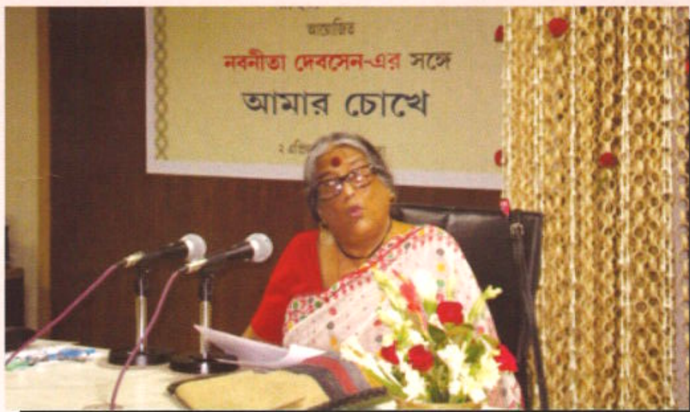
Nabaneeta Dev Sen on Mahasveta Devi 2 April 2014, Kolkata