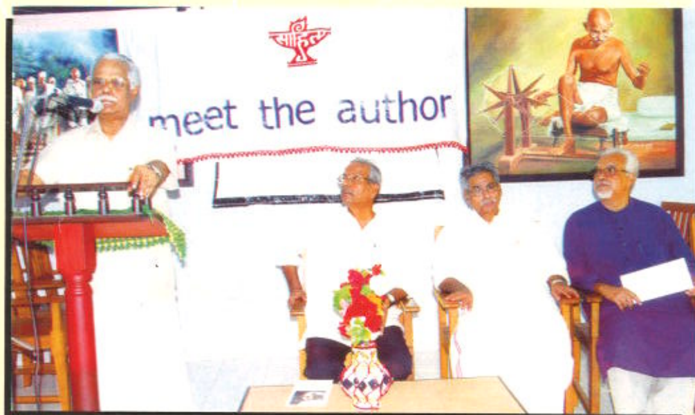
Sri T. Padmanabhan, eminent Malayalam writer 3 May 2014, Payyannur