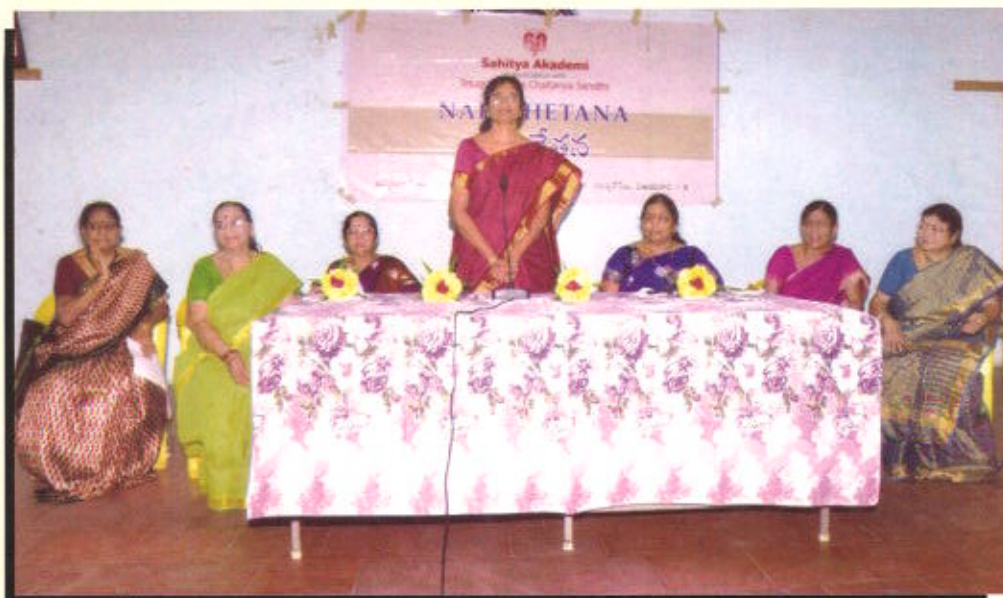
Participants of the programme 27 September 2014, Vijaywada