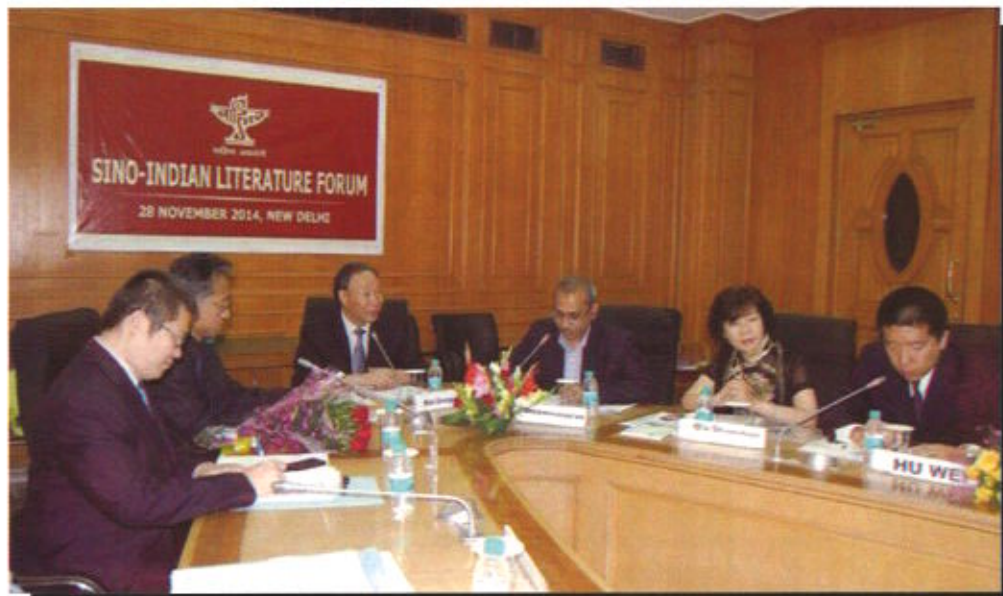
Visiting Chinese delegation at the programme 28 November 2014, New Delhi