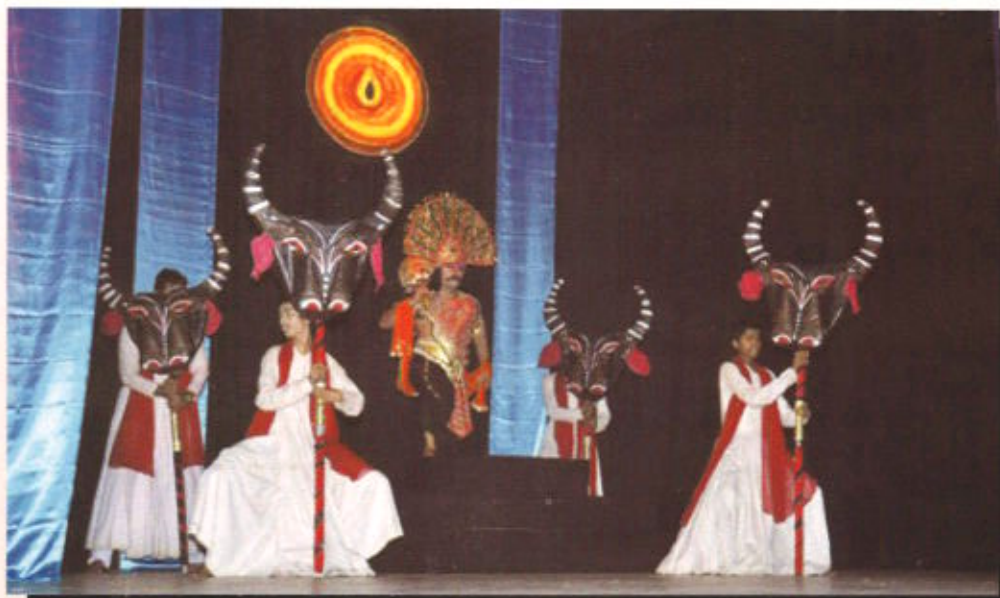
National Theatre Festival 16-21 January 2015, Bengaluru