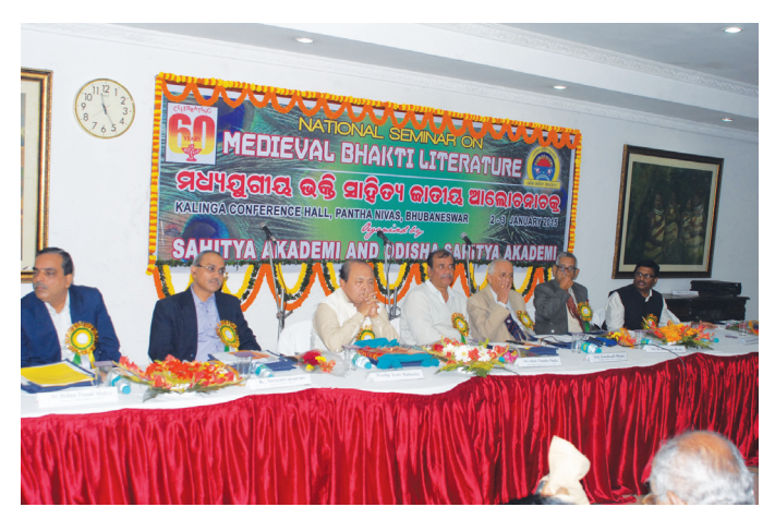
Inaugural Session of the Seminar in progress

A s part of its diamond jubilee celebrations, Sahitya Akademi organized a two-day national seminar on 'Medieval Bhakti Literature' focusing on medieval bhakti schools of the eastern parts of India on January 2-3, 2015 at the Kalinga conference hall in Bhubaneswar.