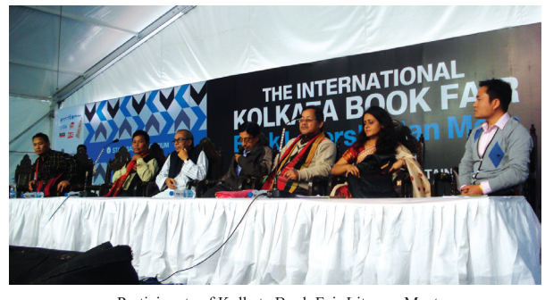
Participants of Kolkata Book Fair Literary Meet

The regional office of Sahitya Akademi at Kolkata organized a literary forum on "Discourse on the Contribution of North Eastern Literature towards Indian Literature" with a short poetry reading session at the Kolkata Book Fair on January 31, 2015.