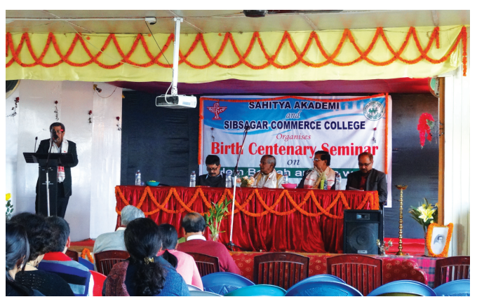
Inaugural Session of the Seminar in progress

The regional office of Sahitya Akademi at Kolkata, in association with Sibsagar Commerce College, organized a birth centenary seminar on the legendary Assamese writer, Sri Hem Baruah on January 22, 2015 at Sibsagar Commerce College.