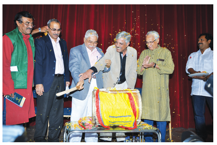
Theatre Festival being inaugurated

Sahitya Akademi, as part of its diamond jubilee celebrations, organized a six-day National Theatre Festival between January 16, 2015 and January 21, 2015 and a two-day National Seminar on Contemporary Indian Drama on January 19, 2015 and January 20, 2015 at Guru Nanak Bhavan, Bengaluru.