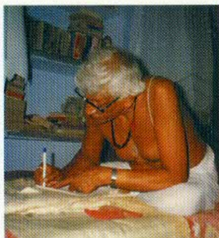
In writing mood