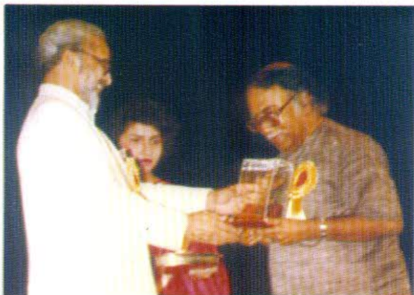
Receiving Sahitya Akademi Award from Prof. U.R. Anantha Murthy, then President of the Sahitya Akademi, 1995

Dilip Chitre has held several important positions like 'Nirala