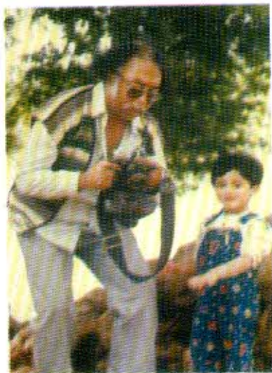
Dilip Chitre with his grandson

Chair of Creative Writing' in Bhopal. He has been Director, 'Vagarth' the Centre for Poetry at Bharat Bhavan, Bhopal, Convener and Director, 'Valmiki World Poetry Festival', Delhi and also Editor of New Quest , Pune. He is a recipient of Godavarish Memorial Poetry award and Maharashtra State award for his literary works. He was Elected Fellow of the International Writing Program, University of Iowa, USA, German Academic Exchange (DAAD) Fellow, Writer-in-Residence at the Universities of Heidelberg and Bamberg in 1991-92, Emeritus Fellow of the Union Ministry of Human Resource Development and the First Indira Gandhi Fellow of the Indira Gandhi National Centre for the Arts in 1996. Shri Sant Tukaram Maharaj Gaurav was specially awarded to him in 1999 as part of the 350th Anniversary of the Ascension of Tukaram.