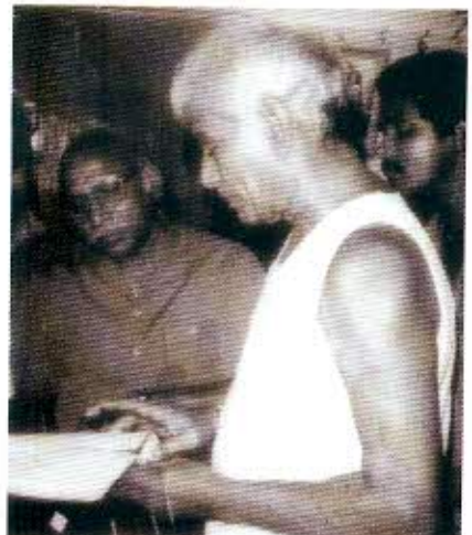
With Padma Vibhushan Baba Amte at Anand Varora