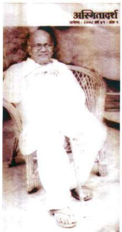
Asmitadarsh: A Special issue (Jan-Feb-Mar., 2008) on late Baburao Bagul, distinguished Marathi writer

edited a number of works of literary and cultural significance. Recently, he has been elected President of the first Marathi Vishwa Sahitya Sammelan to be held in the USA.