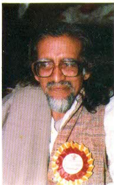
Sahitya Akademi Award-winner

Mathuram Gayati ("Sweet is the Music") is an extended allegorical fable of a post-holocaust world where the two hemispheres of the earth are apart and at war, and can only unite again through the harmonious, un-analysable power of love, which alone can bring together the divisive energies of the universe. Pravachakante Vazhi ("The Way of the Prophet"), Vijayan's recently completed novel, was serialized in the popular weekly Kalakamudi . This major work affirms, in fictional mode, the oneness of perennial revelation, which is