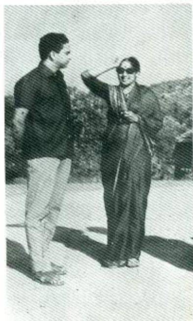
With actress Snehlata Reddy

Anantha Murthy has so far published three novels, five collections of short stories, one drama, three collections of poetry and five collections of essays and criticism.